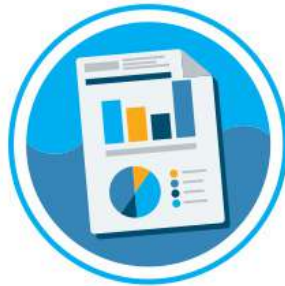
Rate Case Planning