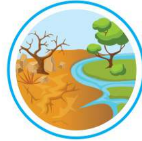
Water Shortage Contingency Plan