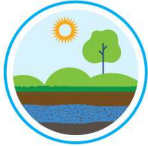
Groundwater Sustainability Plan