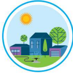
Urban Water Management Plan