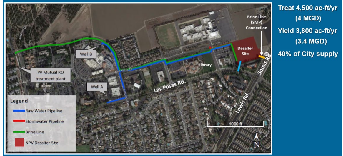
Fig. 1. Desalter Project Overview.