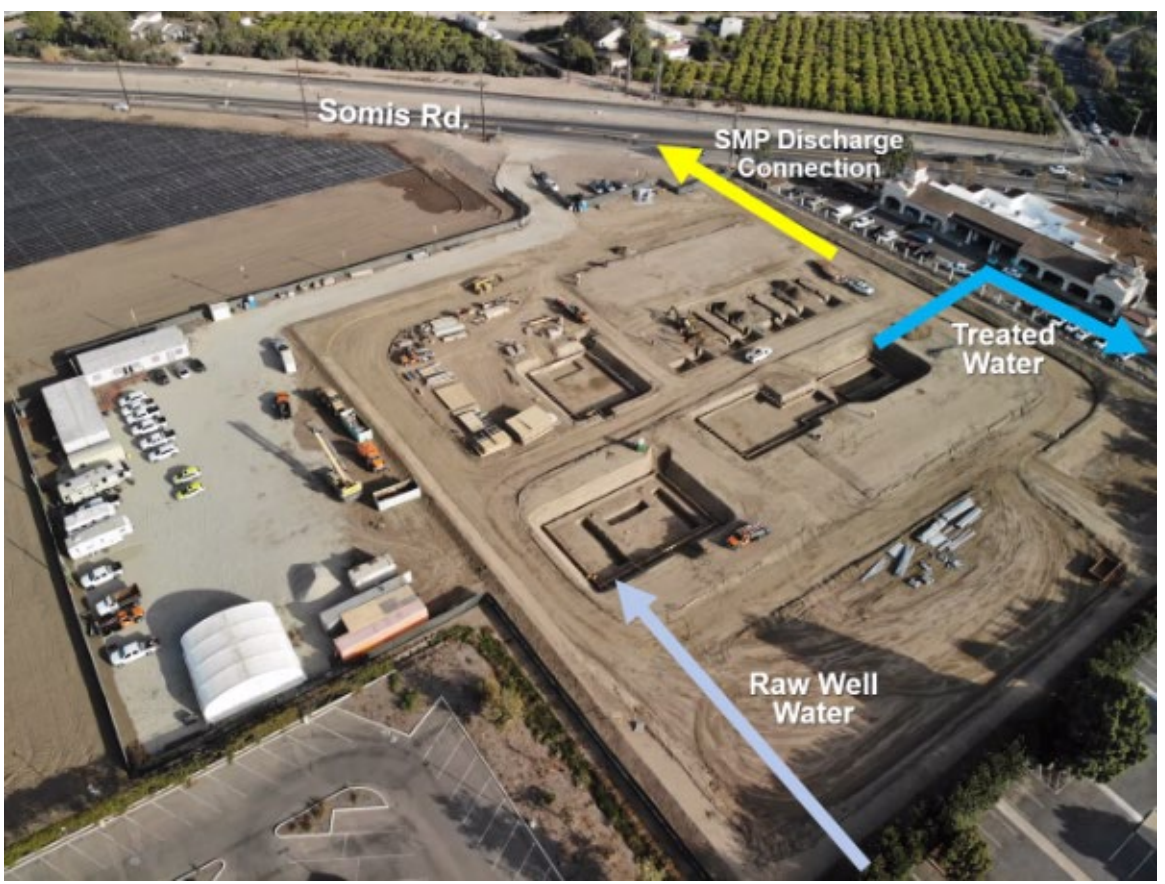
Fig. 3. Project Site View.