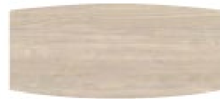
Boat Single or Modular