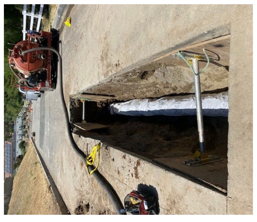
Above is a repair attempt in June 2023