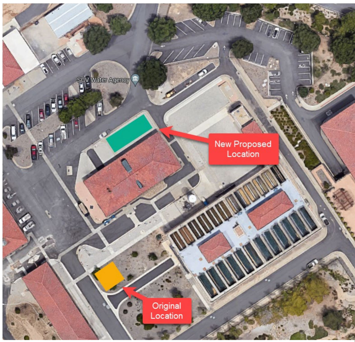
Figure 1- SCV Water - RVWTP Proposed BESS Location

California Government Code sections 4217.10 to 4217.18 allow public agencies (including water agencies) to enter into energy services contracts, which include energy services contracts for the design and installation of battery energy storage projects, without using a formal competitive bid process. In August of 2022, SCV Water issued a request for proposals (RFP) with the help of TVE to obtain proposals for the design, supply, installation, operation, and maintenance of solar photovoltaic and battery energy storage across two Agency sites. After there were no formal responses to the RFP, the Agency narrowed the scope to focus on the battery energy storage systems. TVE then obtained competitive proposals for the design, supply, installation, operation, and maintenance of battery energy storage systems from multiple contractors. The new scope included construction of a 500 kW battery system with resiliency capabilities (~4.94 hours), interconnection, energy management system, and operating expenses. Figure 1 notes the proposed location for the battery project at RVWTP.