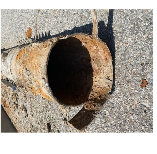
Existing steel pipe removed