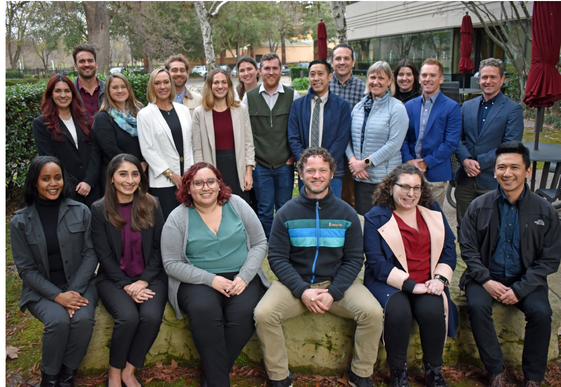
2024 Water Leaders Cohort