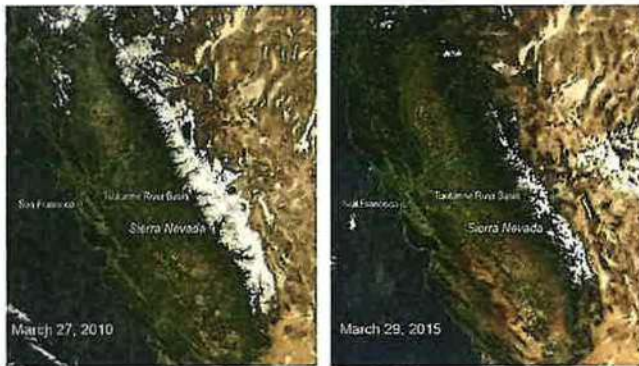
March 2015, snow pack estimated to be at a five hundred year low.

While we understand the Agency's legal requirement to use the DWR Water Delivery Capability Report, we urge you to include some information about climate change so that the public will be aware of the probability of a severely shrinking water supply due to climate change.