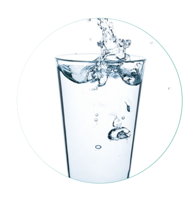
Improve Water Quality